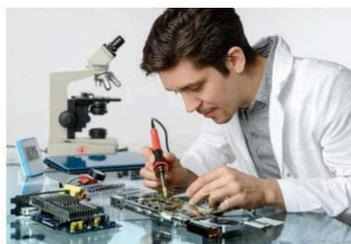
GCEA Technician/Technologist Leadership Award