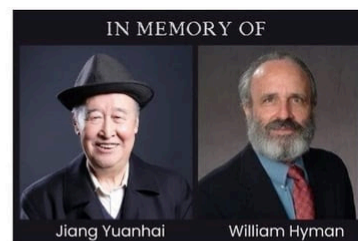
GCEA Jiang Yuanhai & William Hyman Global Academic Award for outstanding contributions to the Clinical Engineering discipline