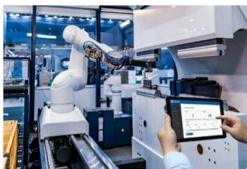
GCEA Collaborative Capacity Building Award